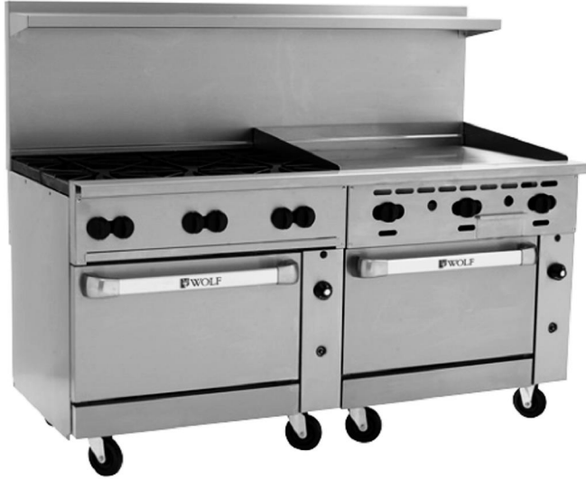
Model C72SC-6B36GN (shown with optional casters)