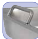
Patented handle system