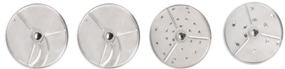
Grating Discs (1/8", 1/4")

U SR Brands is a US supplier of premium quality commercial cooking, refrigeration and food preparation equipment. Our aim is simple. Produce industry-leading commercial restaurant equipment at reasonable prices, and back it all up with an easy to understand, no nonsense warranty that people can count on.