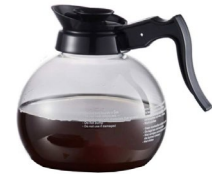
(2) Glass Coffee Decanter