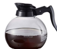
(3) Glass Coffee Decanter included