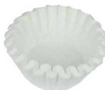
(25) Filter Paper included