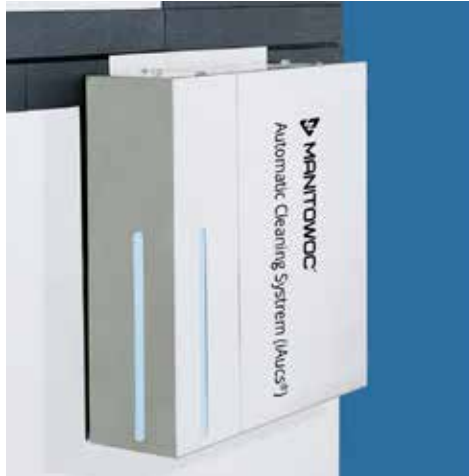
iAuCS for External Mounting