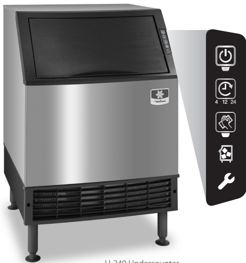
U-240 Undercounter Ice Machine