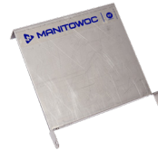
K00482 - Hanger (required with K00461)