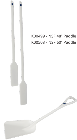
K00499 - NSF 48" Paddle K00503 - NSF 60" Paddle