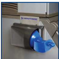
Horizontal left entry bin mount