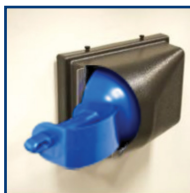
Horizontal right entry wall mount