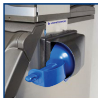
Horizontal right entry bin mount