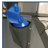
Vertical left side bin mount