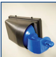
Horizontal left entry wall mount