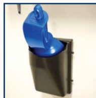
Vertical wall mount