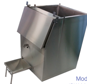
Model Shown IBW-M4 Marine Bin

Please contact the Manitowoc Ice sales department for details.