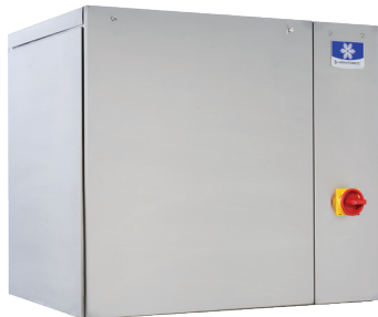
Model shown- IDT0900WM