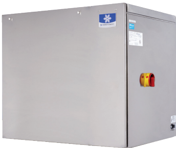
Model shown- IDT0750WM