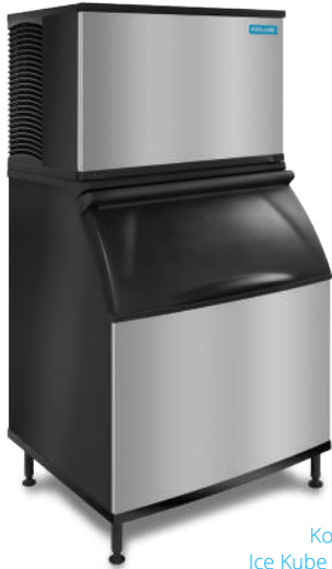
Koolaire KT-0300 Ice Kube Machine on K400 Bin

Koolaire by Manitowoc ice machines are designed, developed and tested by Manitowoc engineers to provide great ice production, energy efficiency and reliable service at an affordable price.