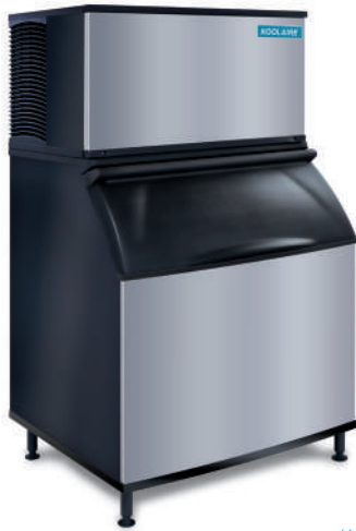
Koolaire KT-1700 Ice Kube Machine on K970 Bin

Koolaire by Manitowoc ice machines are designed, developed and tested by Manitowoc engineers to provide great ice production, energy efficiency and reliable service at an affordable price.