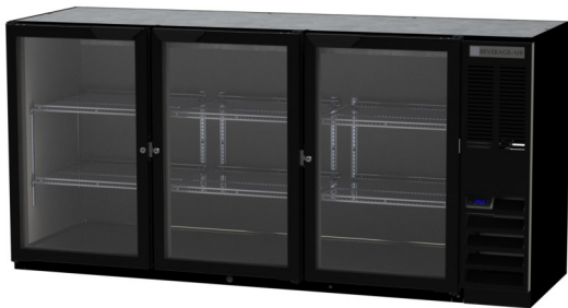
BB72HC-1-FG-B (Black model shown)