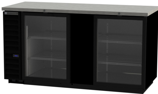
BB68HC-1-FG-B (Black model shown)