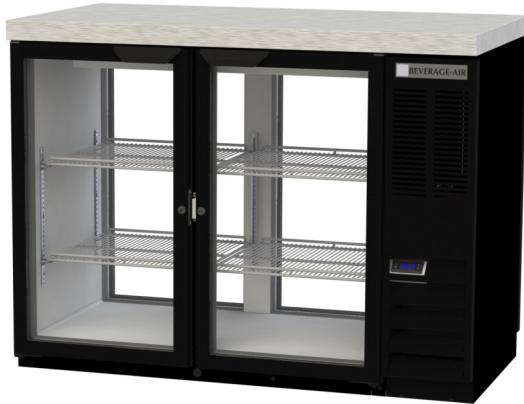
BB48HC-1-G-PT-B-27 (Black model shown)