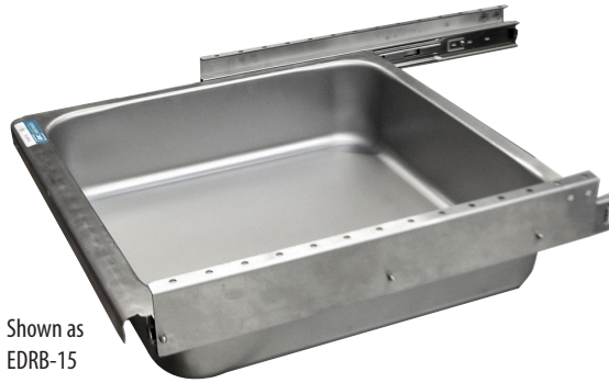
Shown as EDRB-15

Use your smart phone to scan the above QR code to visit our website: www.bk-resources.com